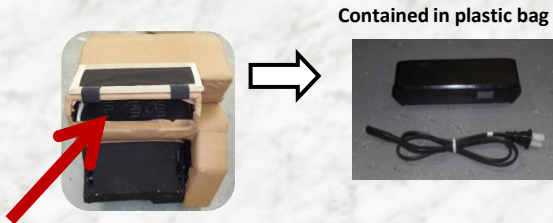
Contained in plastic bag

2-Take the bag that contains the connecting items which you will find inside the back behind the furniture.